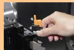
The variation of tightening can be reduced by turning it until the right place when it "clicks"